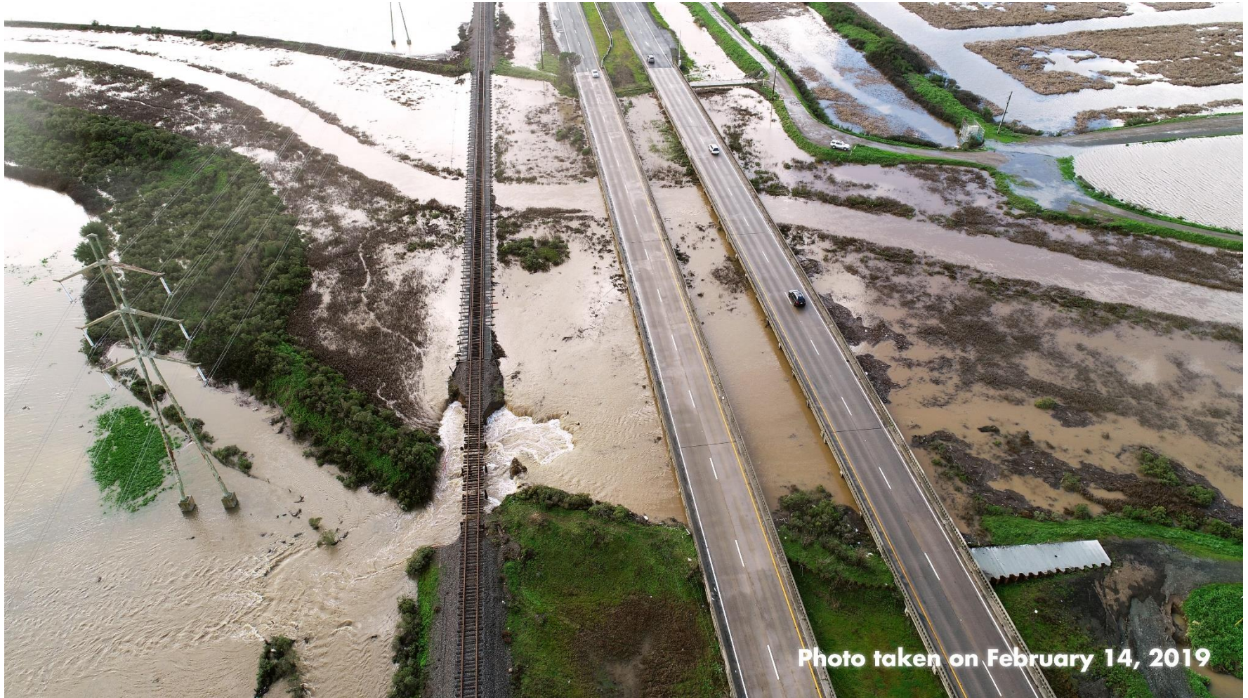
Photo taken on February 14, 2019