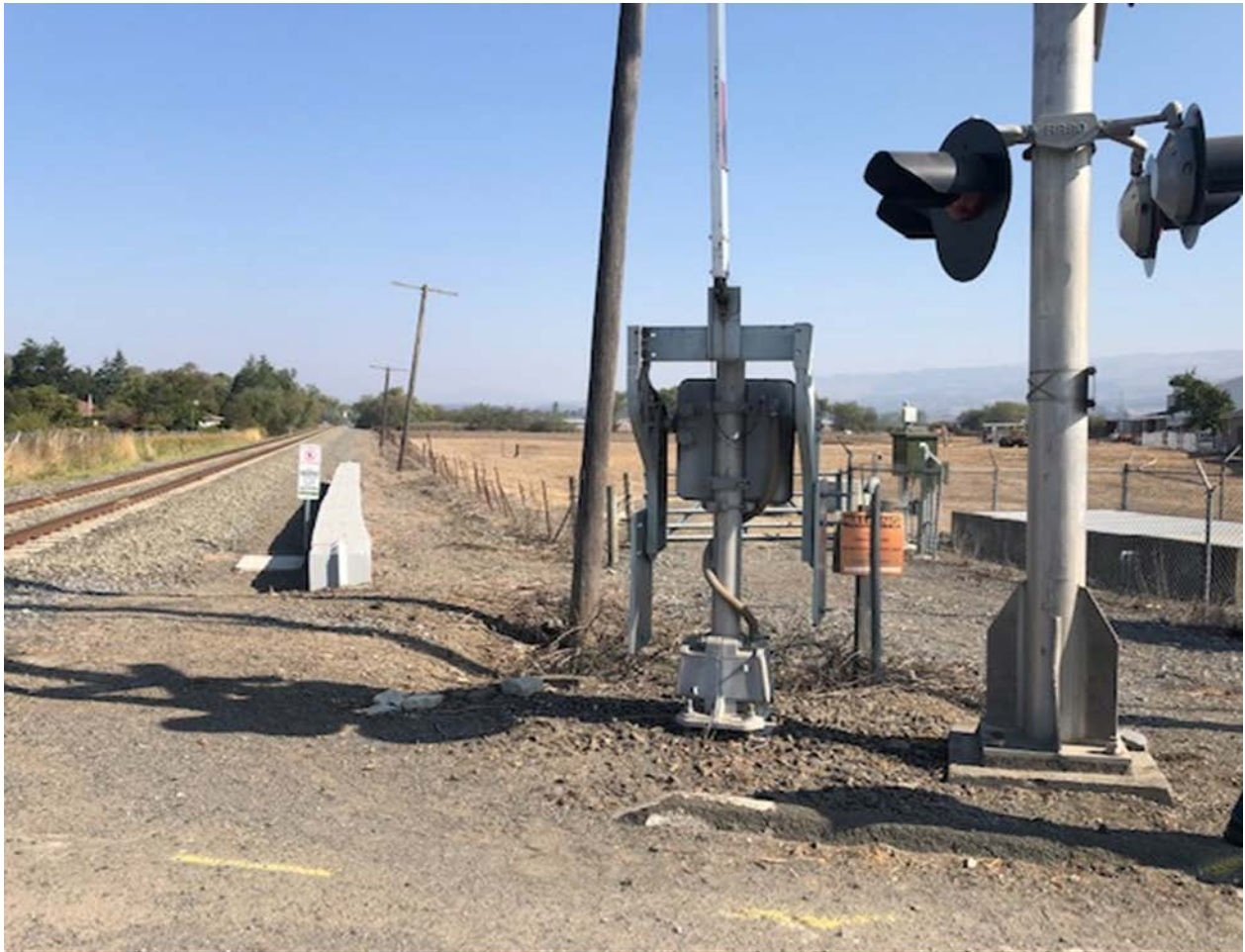
Ely Road Future Pathway Location in Petaluma

GHD Inc. and their subcontractors are working on the first 50% level submittal. Preliminary engineering data including environmental, geotechnical, and survey are being integrated into the pathway design.