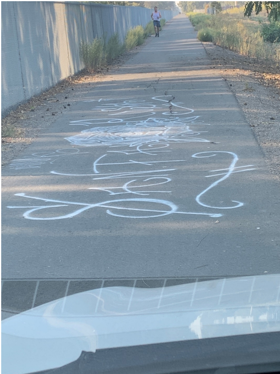
Graffiti on Santa Rosa Pedestrian Bicycle Path