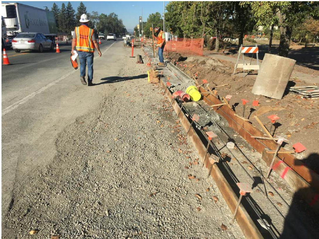
Airport Blvd.- Conducting Survey