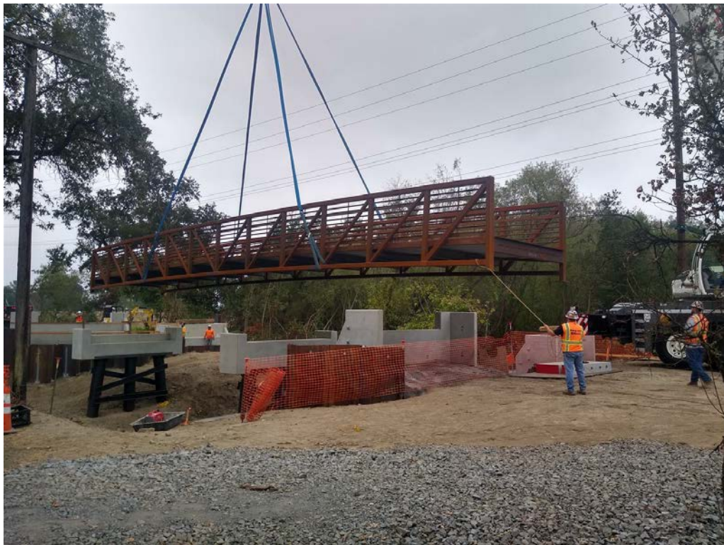
Setting Pool Creek Pedestrian Bridge