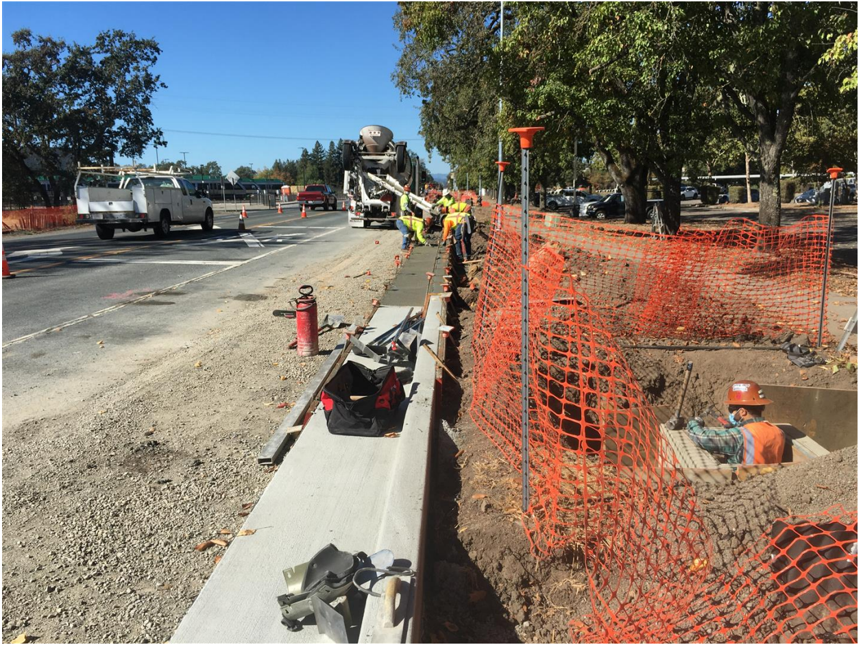
Airport Blvd.- Pouring New Curb and Gutter