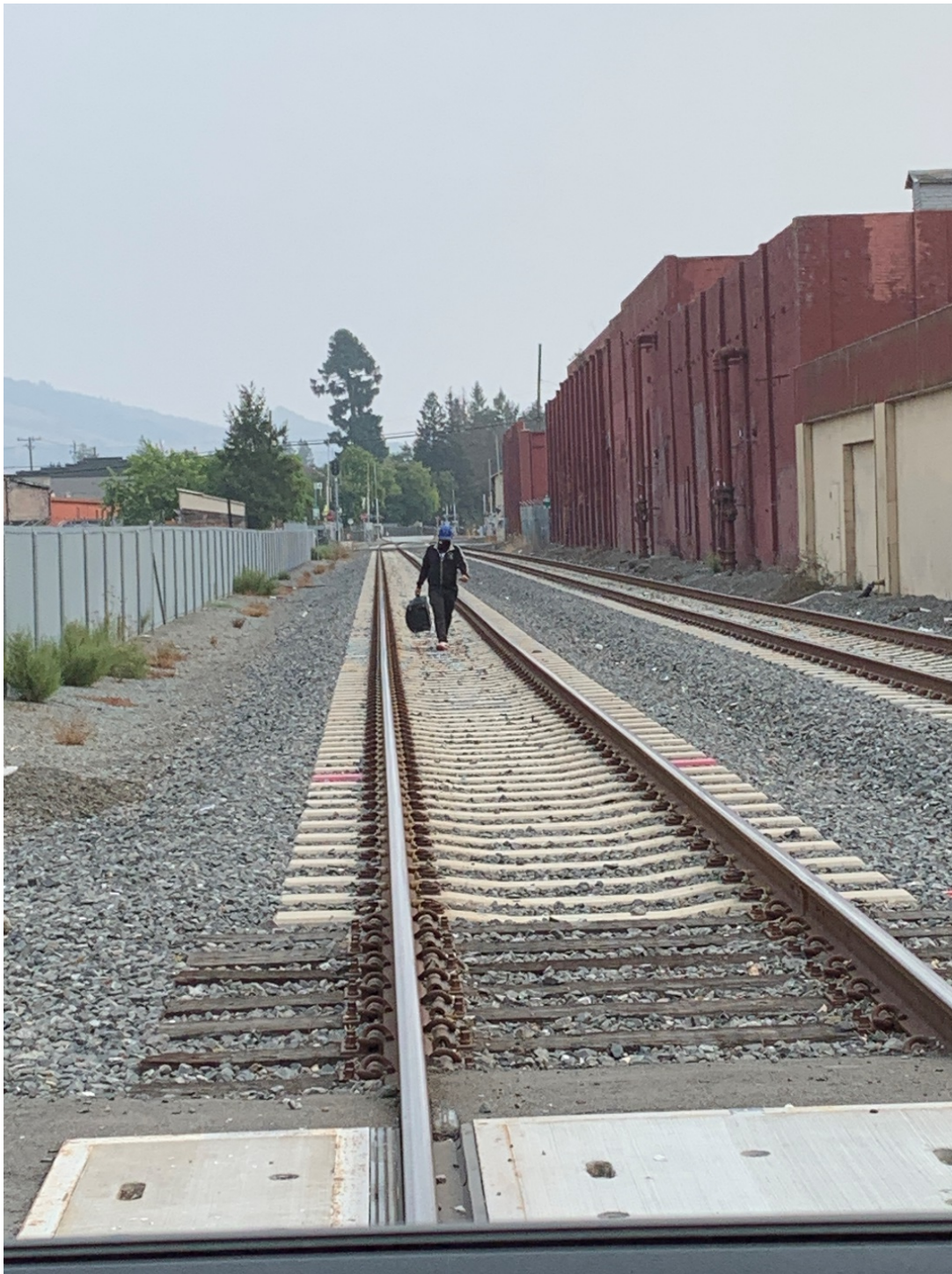
9 th Street Santa Rosa