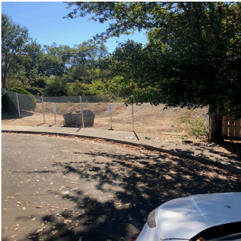
Facilities staff – Completed 6 Foot Chain-link Fence at Commons Court in Windsor