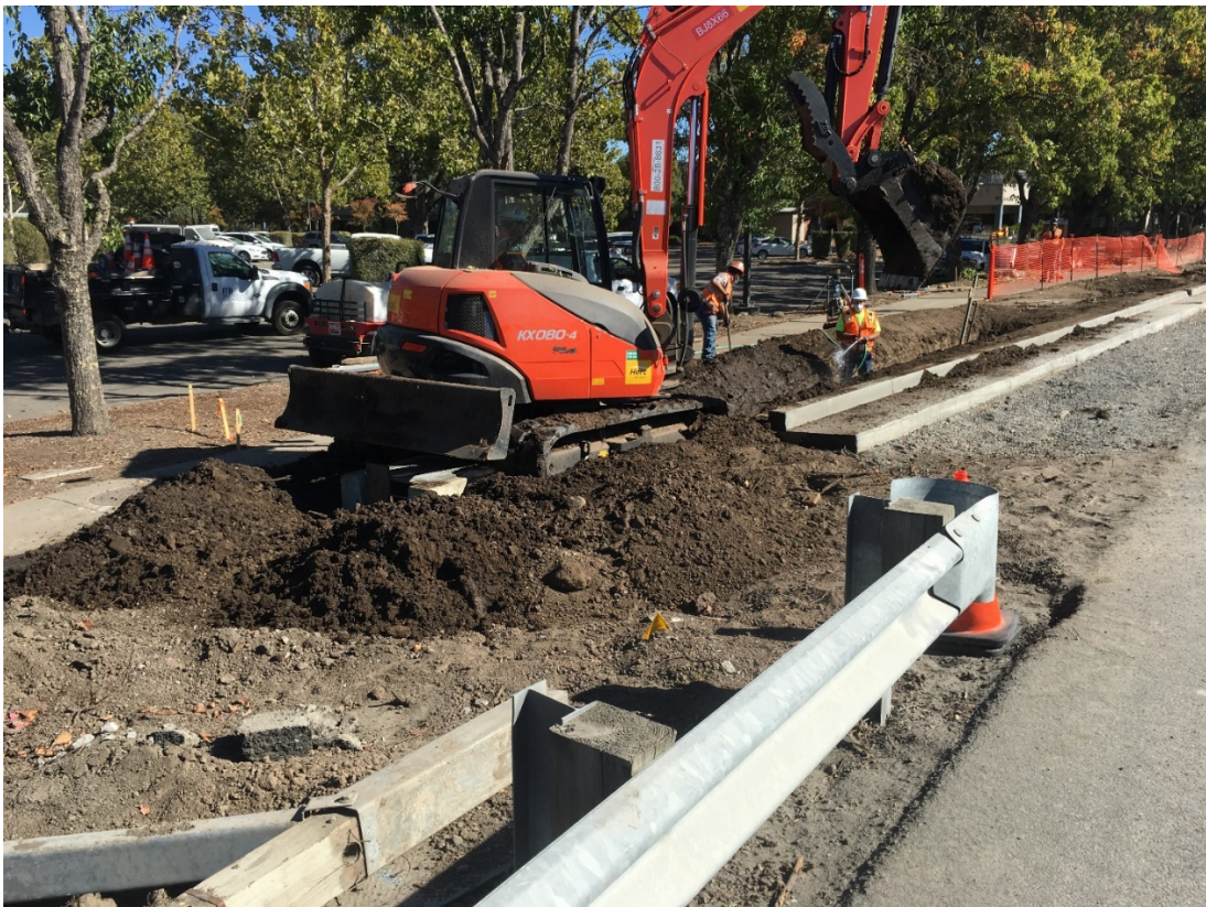
Airport Blvd.- Excavating Biobasins