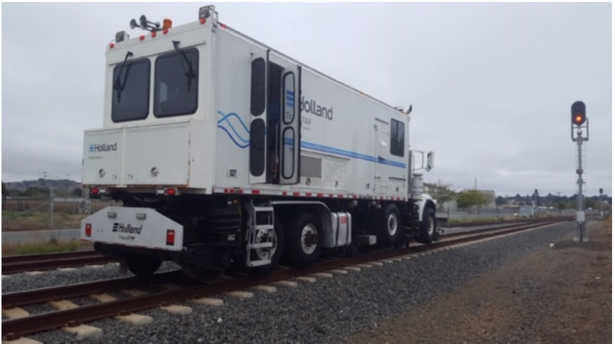
Track staff along with Holland Company – Annual Track Geometry Inspection