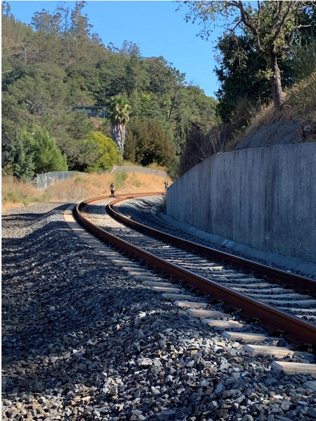
Puerto Suello Tunnel