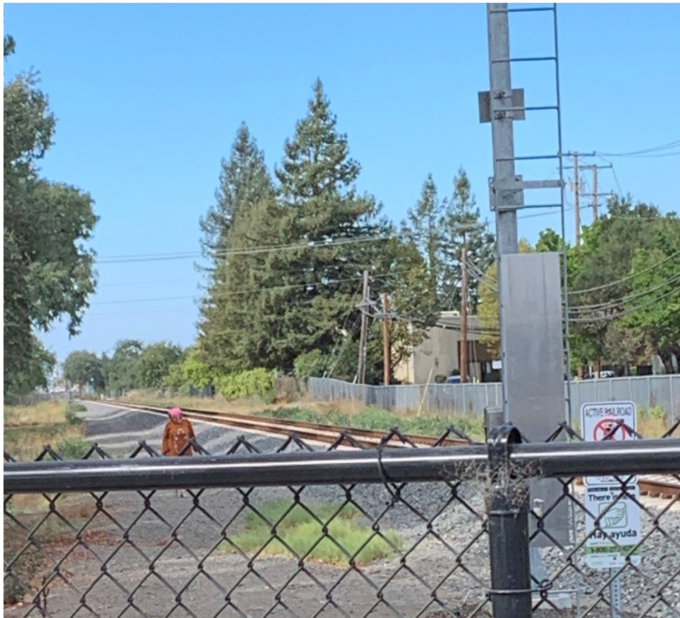
Steele Lane, Santa Rosa