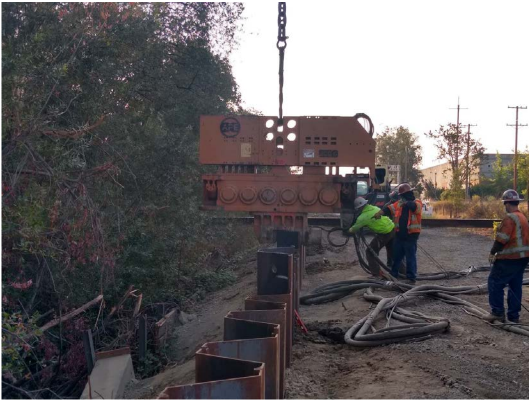
Installing Sheet Piles South of Pool Creek