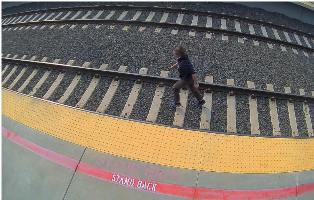
Jumping off of platform San Rafael