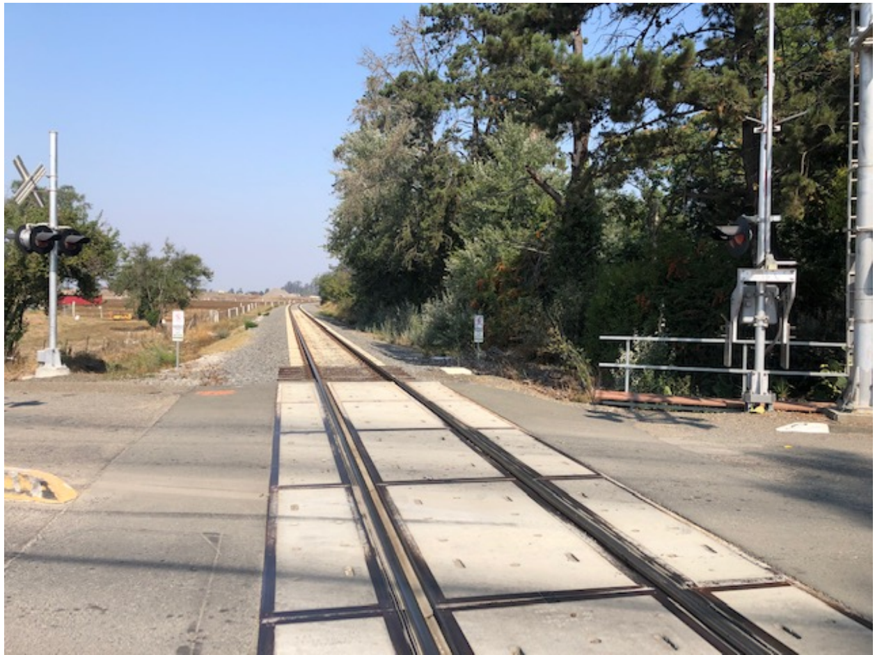
Scenic Avenue Future Pathway Location in Santa Rosa