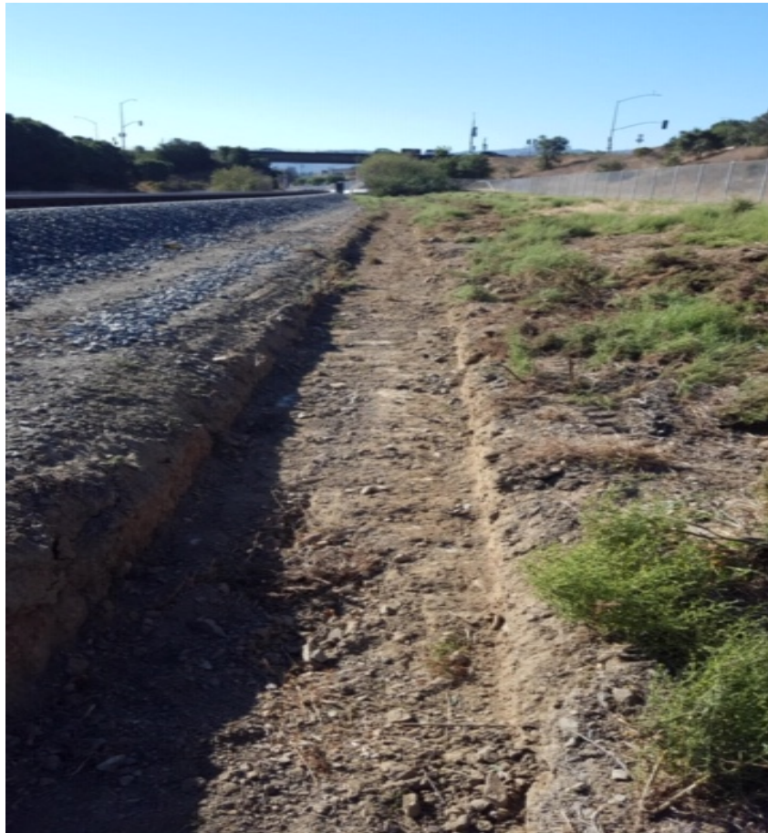
Track Team – Annual Culvert Inspections, Vegetation Removal and Management