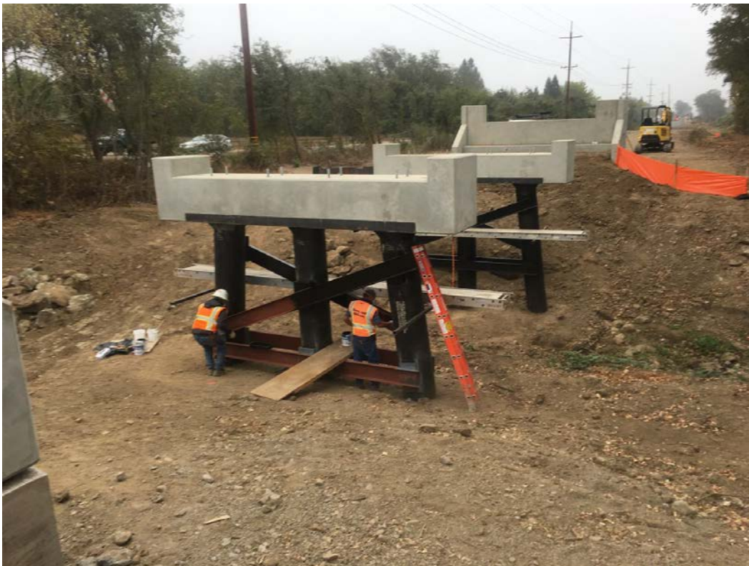
Painting Windsor Creek Bridge Abutments