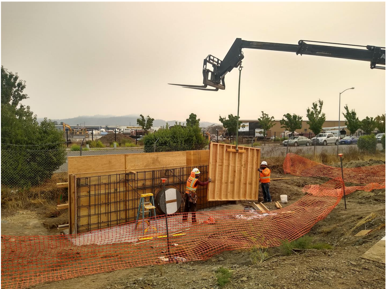
Setting Formboards for Drainage Structure