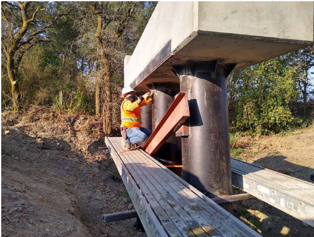
Preparing Bridge Abutments for Paint