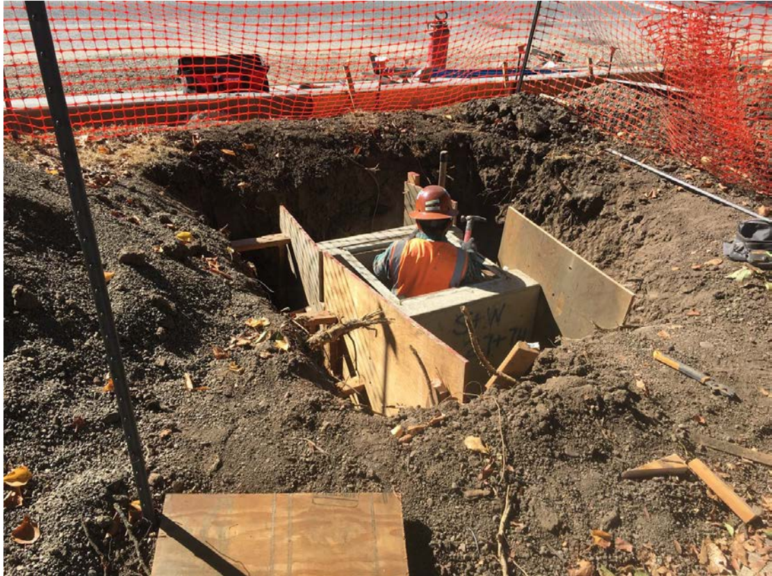
Airport Blvd.- Building Drainage Inlets