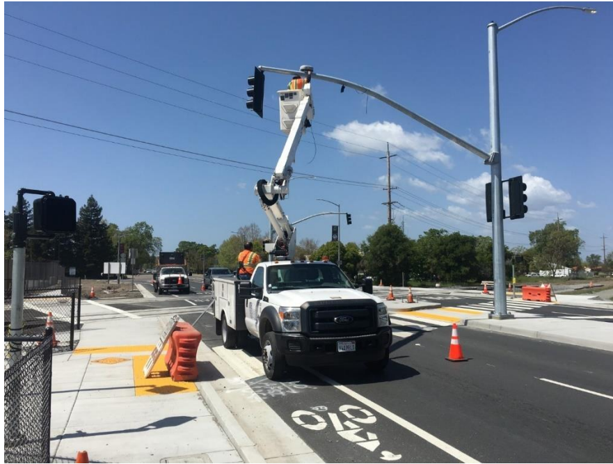
Installation of the Traffic Signal Equipment on Airport Blvd.