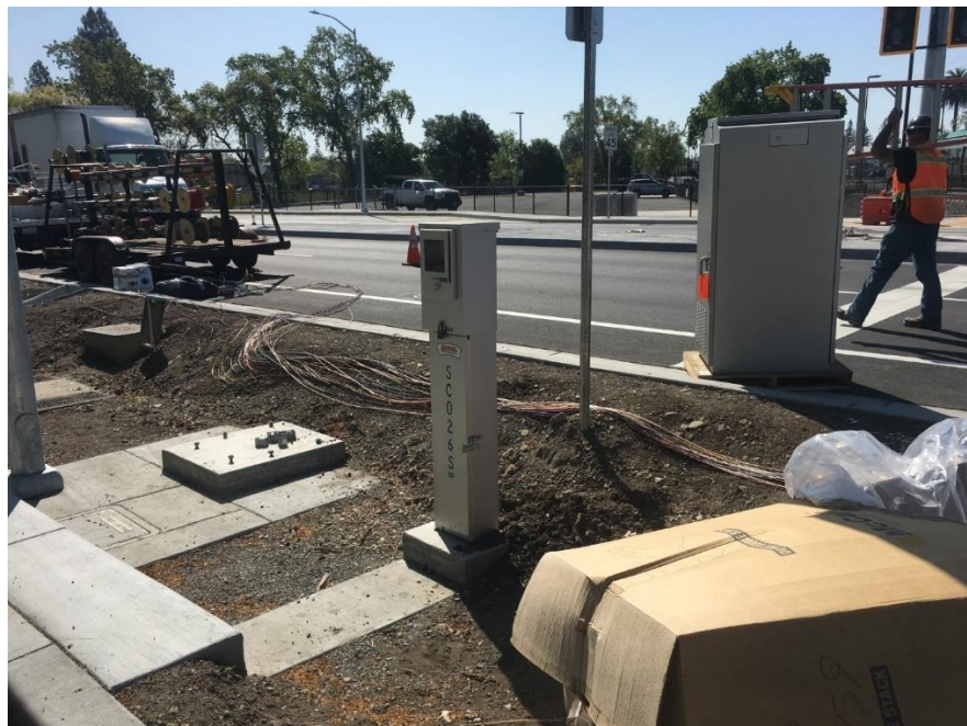
Installing Traffic Signal Controller on Airport Blvd.