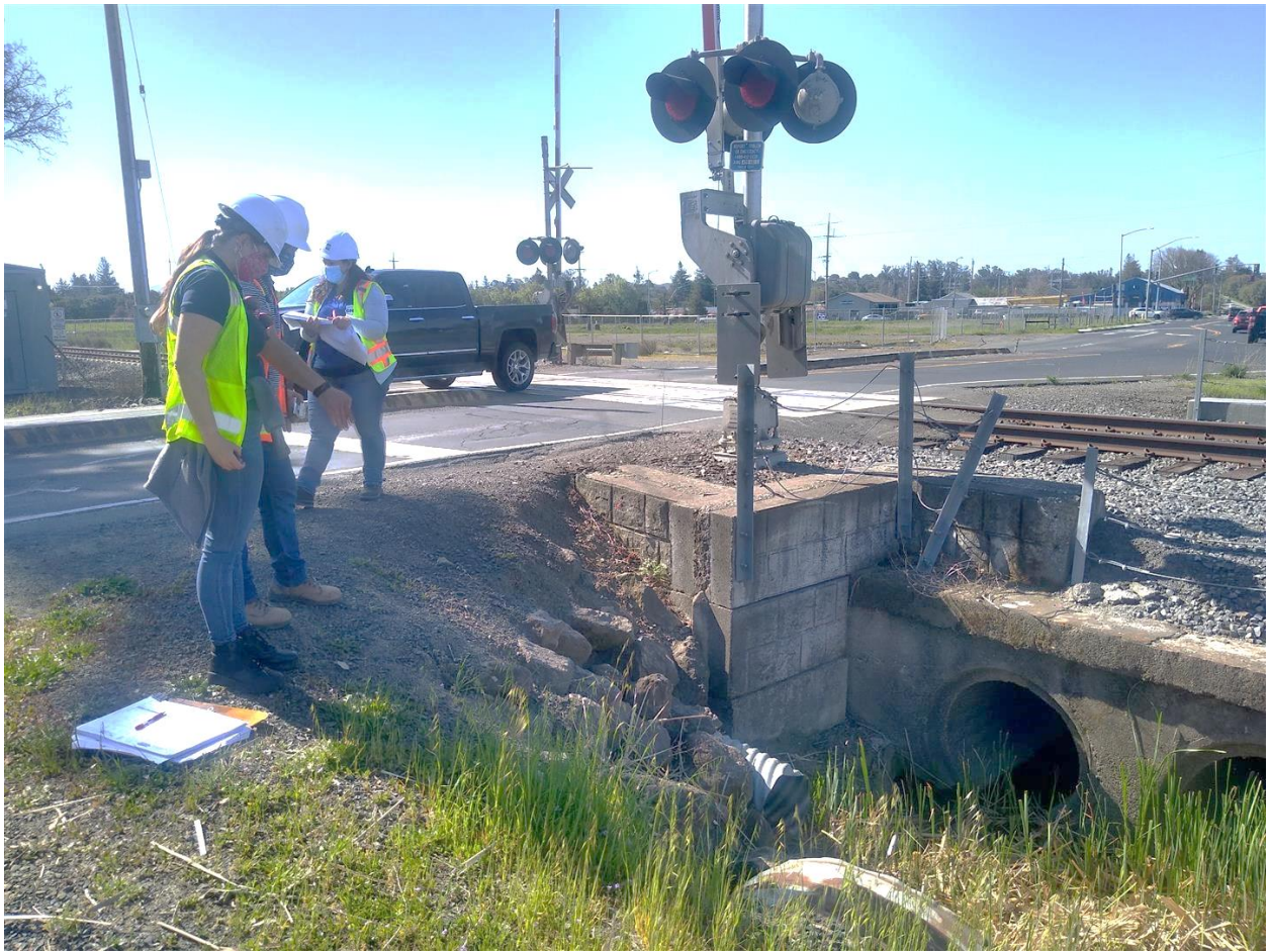
Review of Drainage Issues Along the Future Pathway Alignment in Petaluma