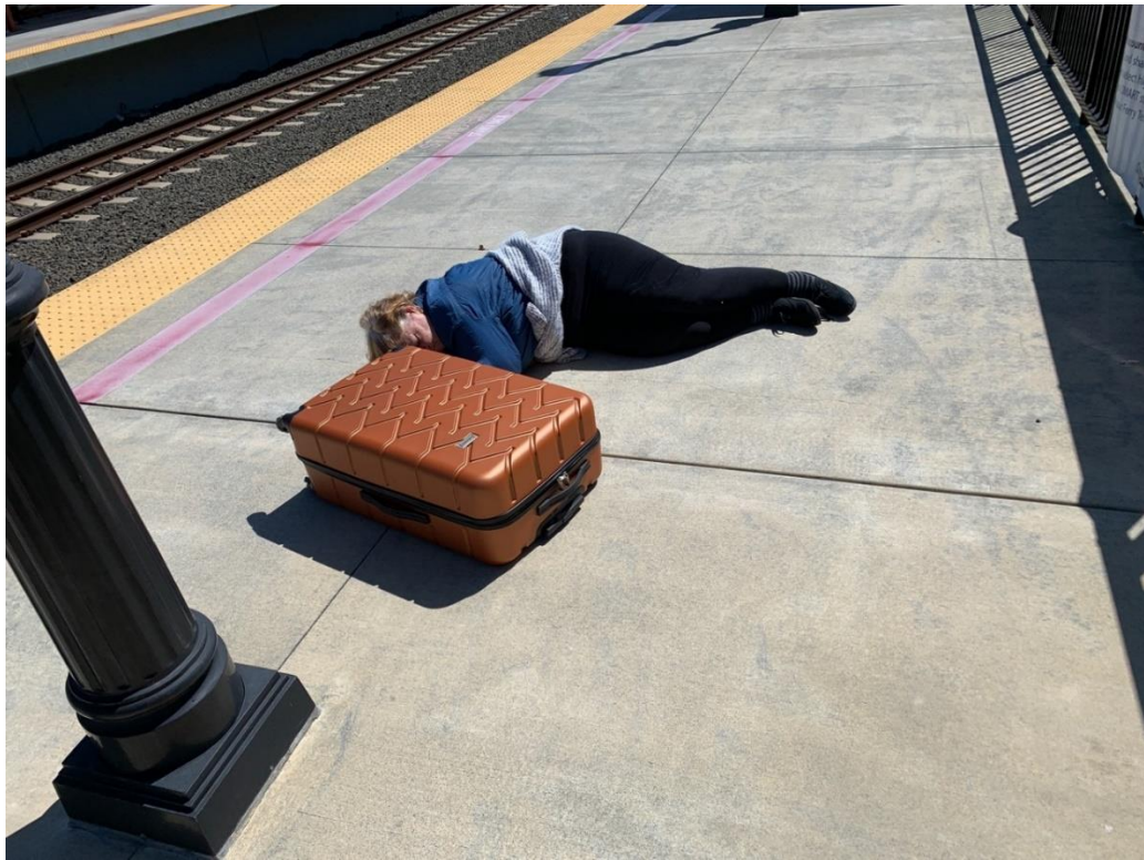
San Rafael Platform – Trespasser sleeping