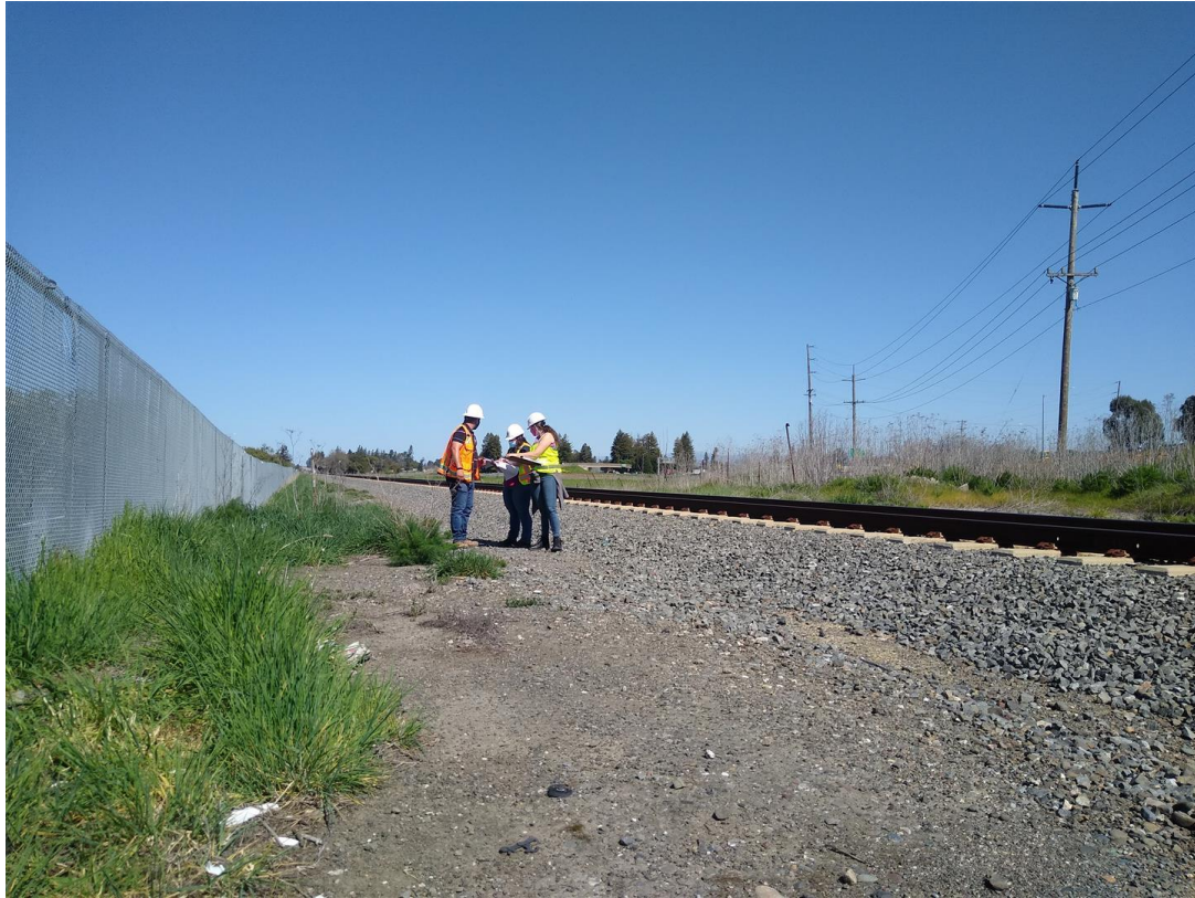
Review of Pathway Alignment in Rohnert Park