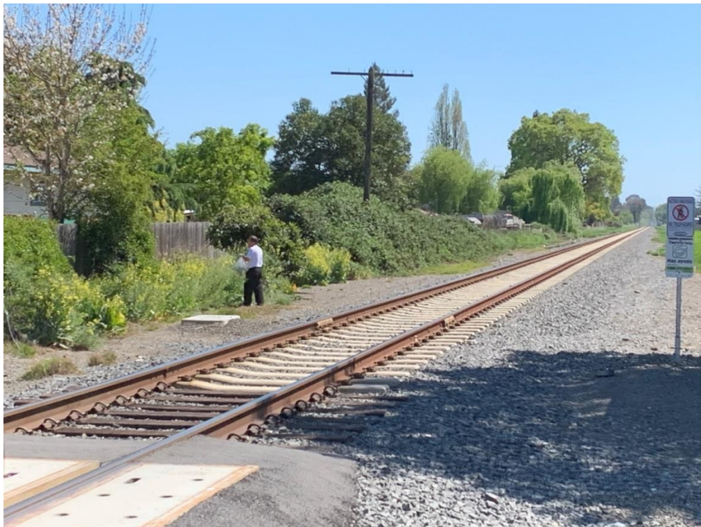
Santa Rosa Bellevue Crossing