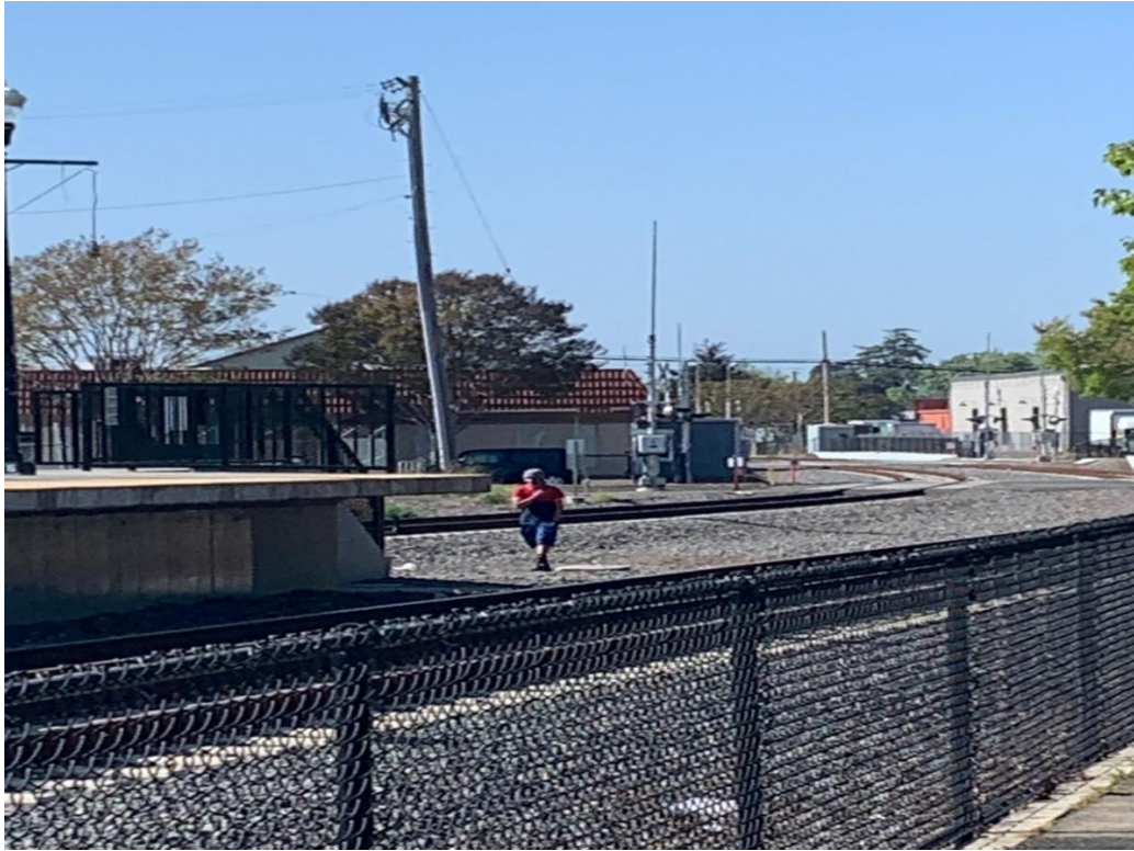
Santa Rosa Downtown