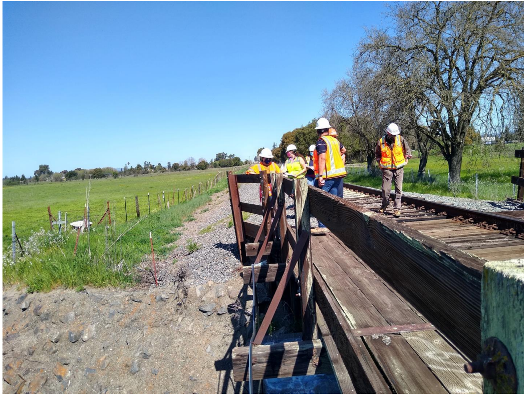
Reviewing site conditions for a Future Pedestrian Bridge in Santa Rosa