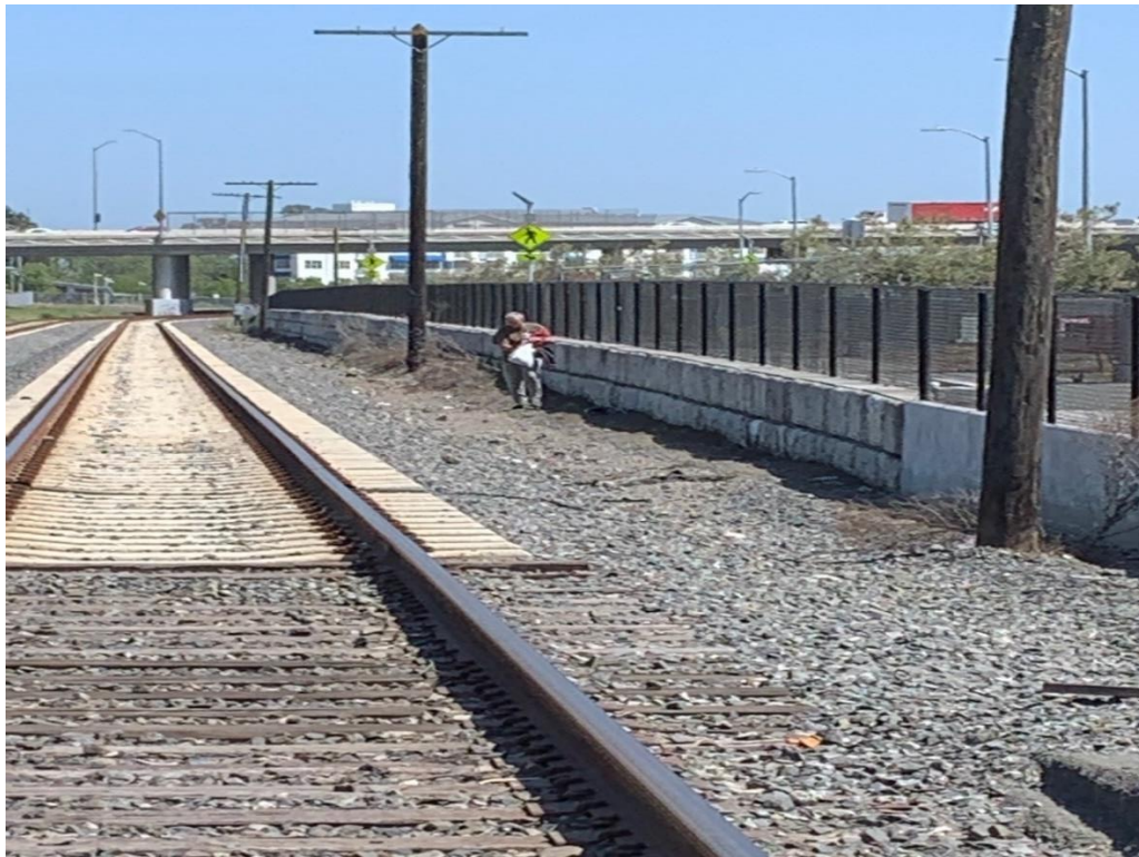
Caulfield Lane – Trespasser near tracks