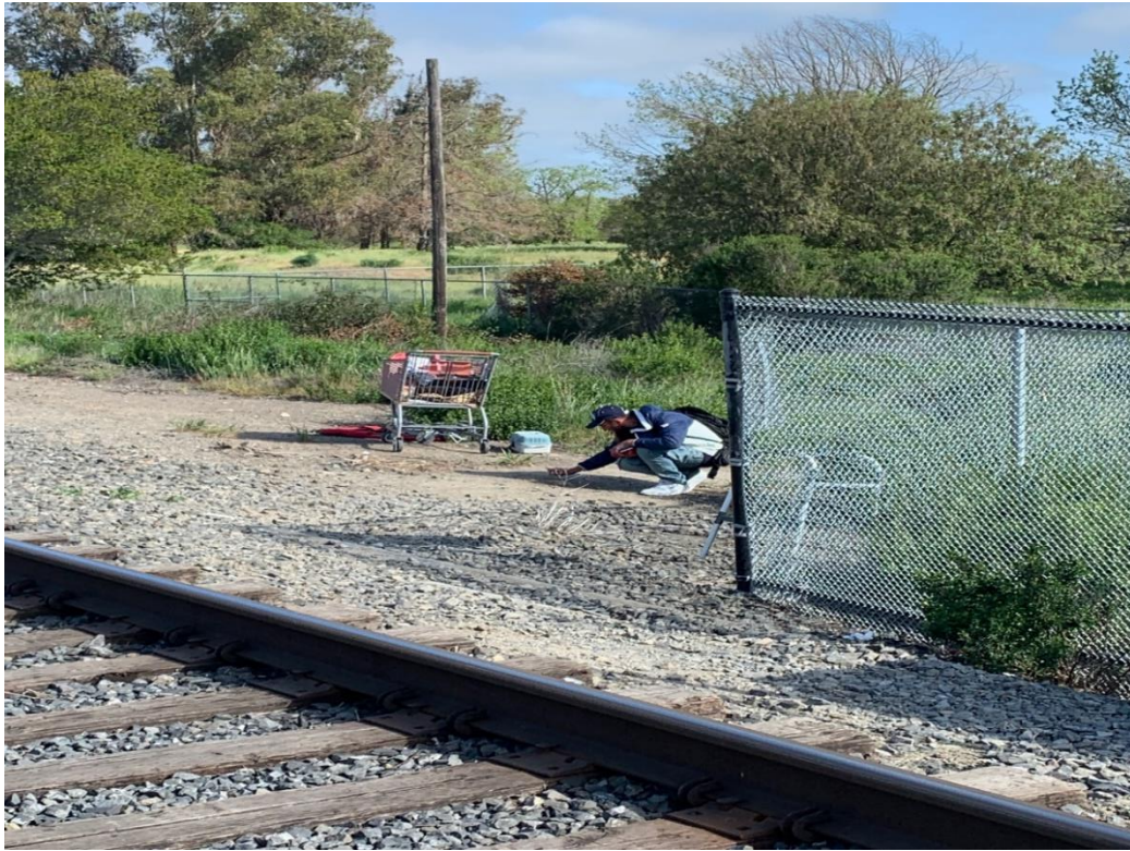
Petaluma – Trespasser near track