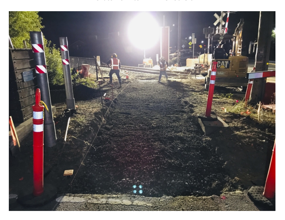
Main St. in Penngrove – Sidewalk Construction

The grade crossing improvements at Main Street in Penngrove are on-going.