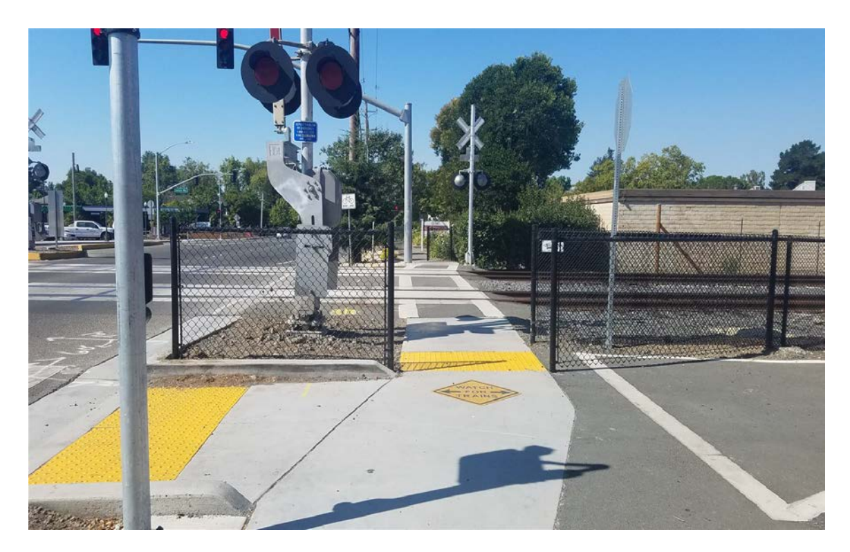
East Cotati Ave., Cotati-Pedestrian Channelization Fence