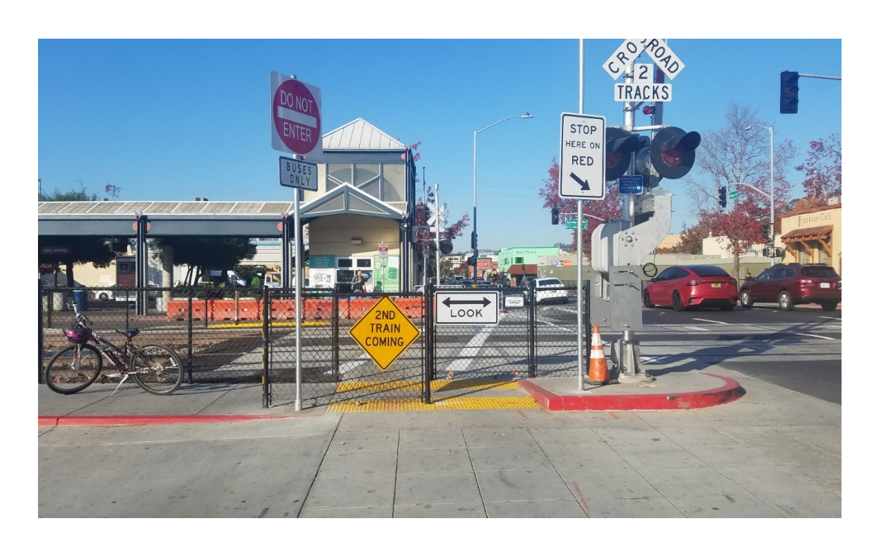
Bettini Transit Center – Pedestrian Safety channelization along 3^{rd} St.