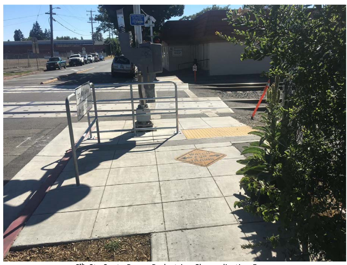
6<sup>th</sup> St., Santa Rosa - Pedestrian Channelization Fence