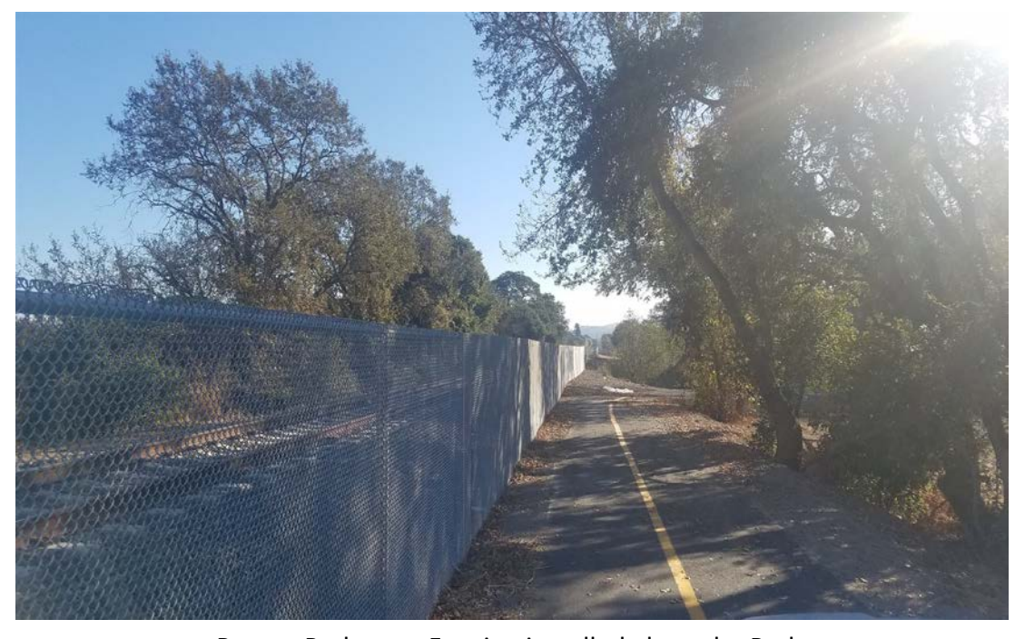
Payran Pathway - Fencing installed along the Pathway