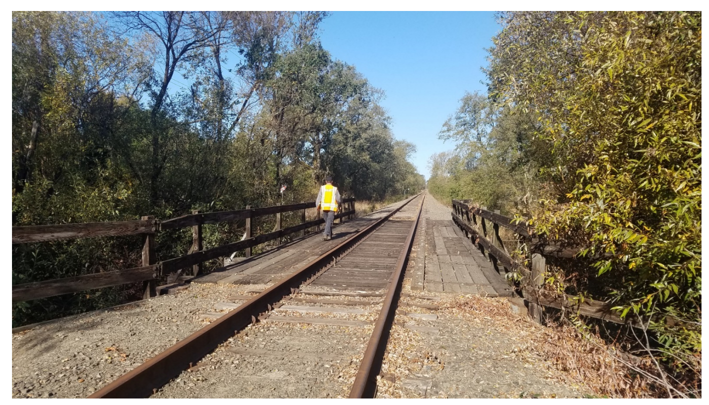
Windsor Extension – Pool Creek Bridge