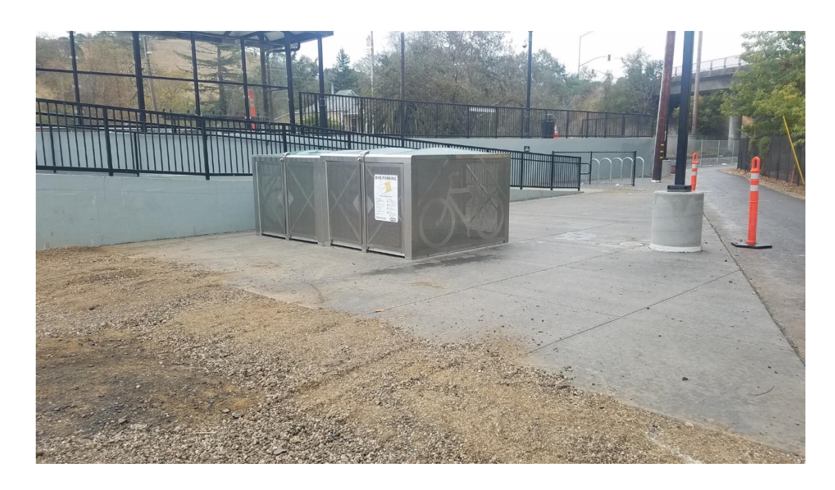
Novato Downtown - Bike Lockers