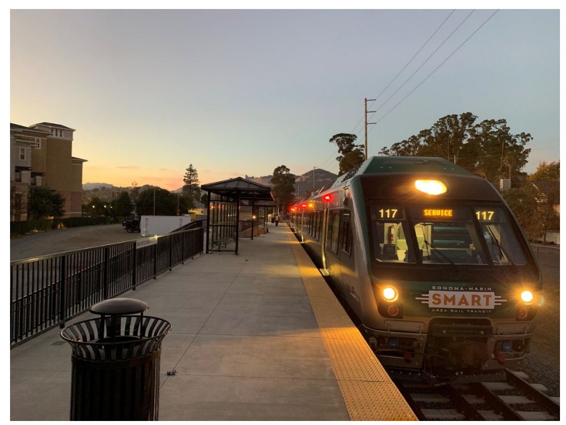
Novato Downtown Station - Train Testing