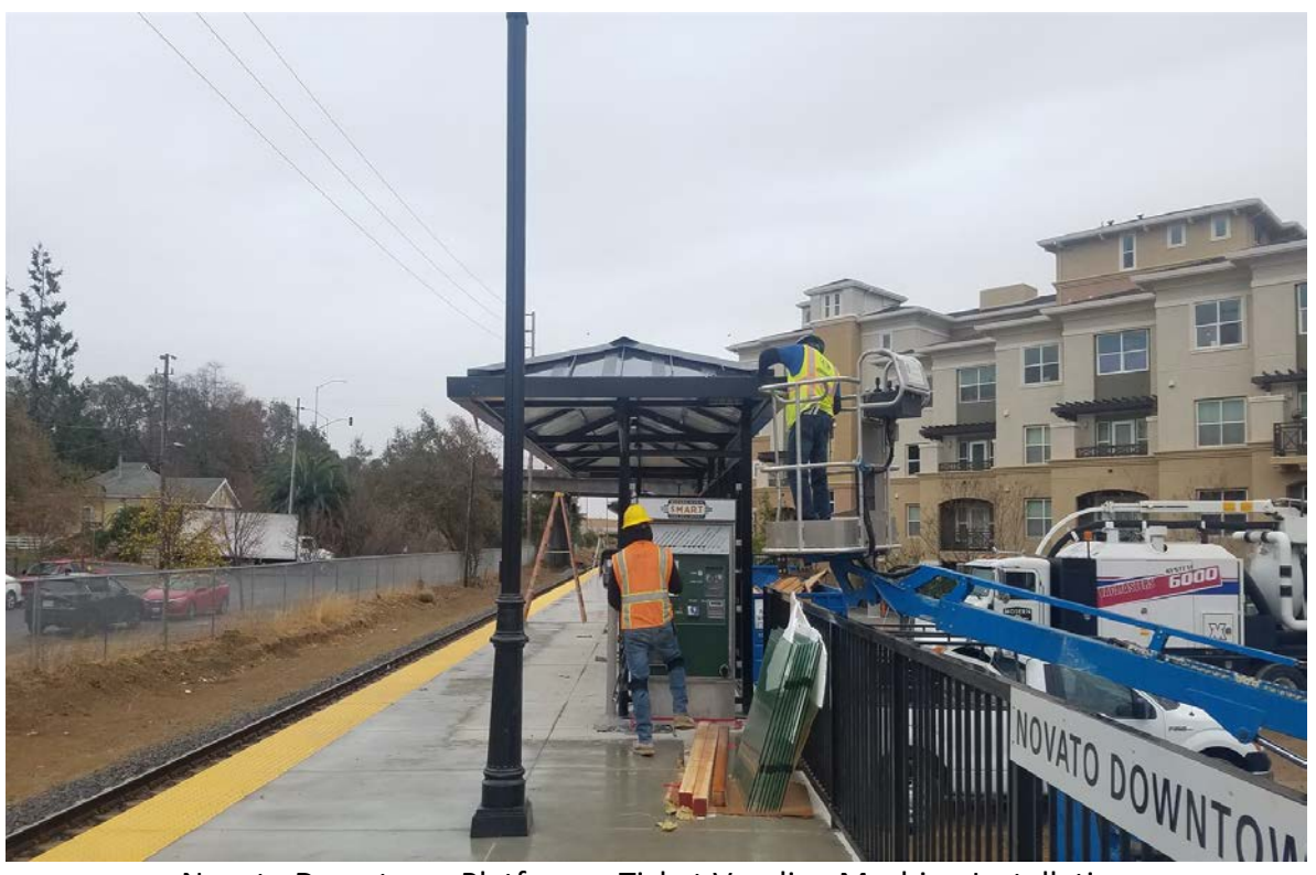
Novato Downtown Platform – Ticket Vending Machine Installation