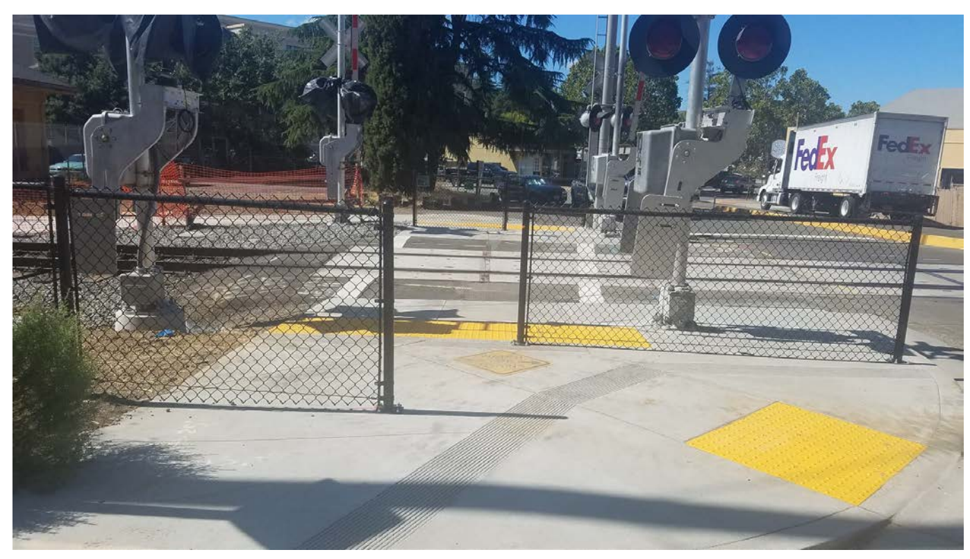
Grant Ave., Novato - Pedestrian Channelization Fence