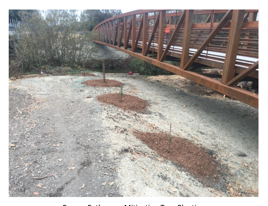
Payran Pathway – Mitigation Tree Planting