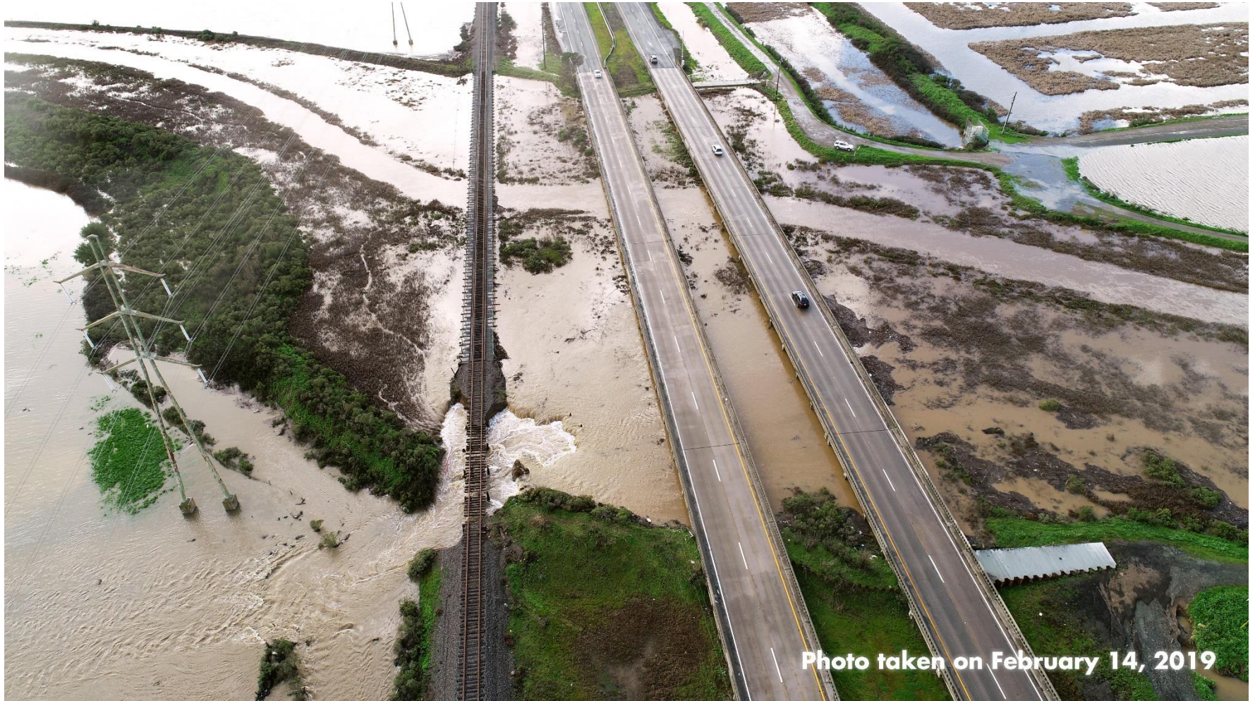
Photo taken on February 14, 2019