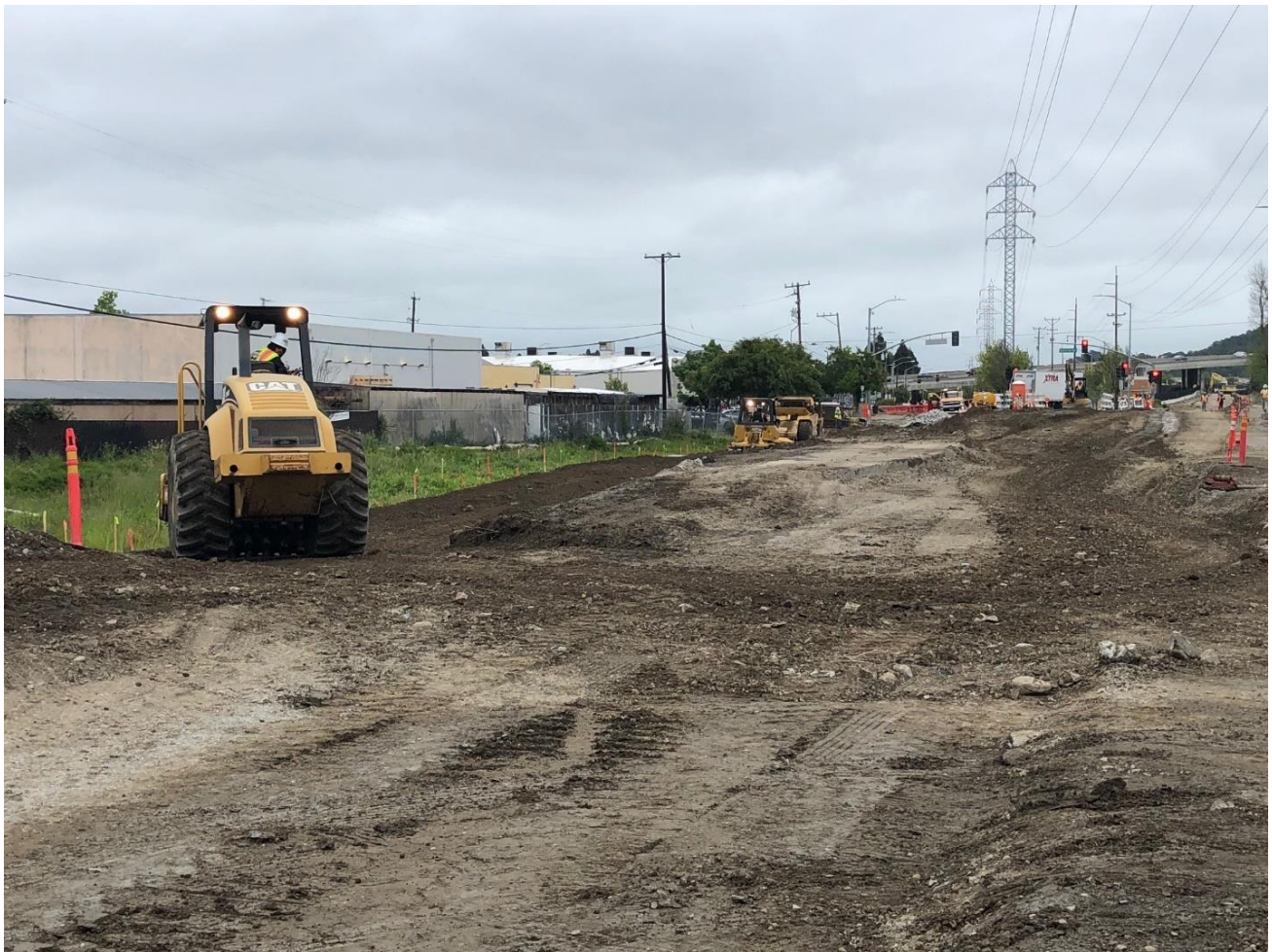
Andersen Drive Grade Crossing grading work