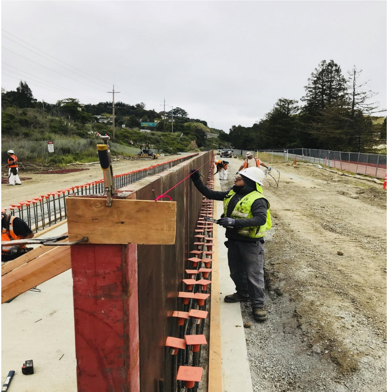
Larkspur Station Platform Construction