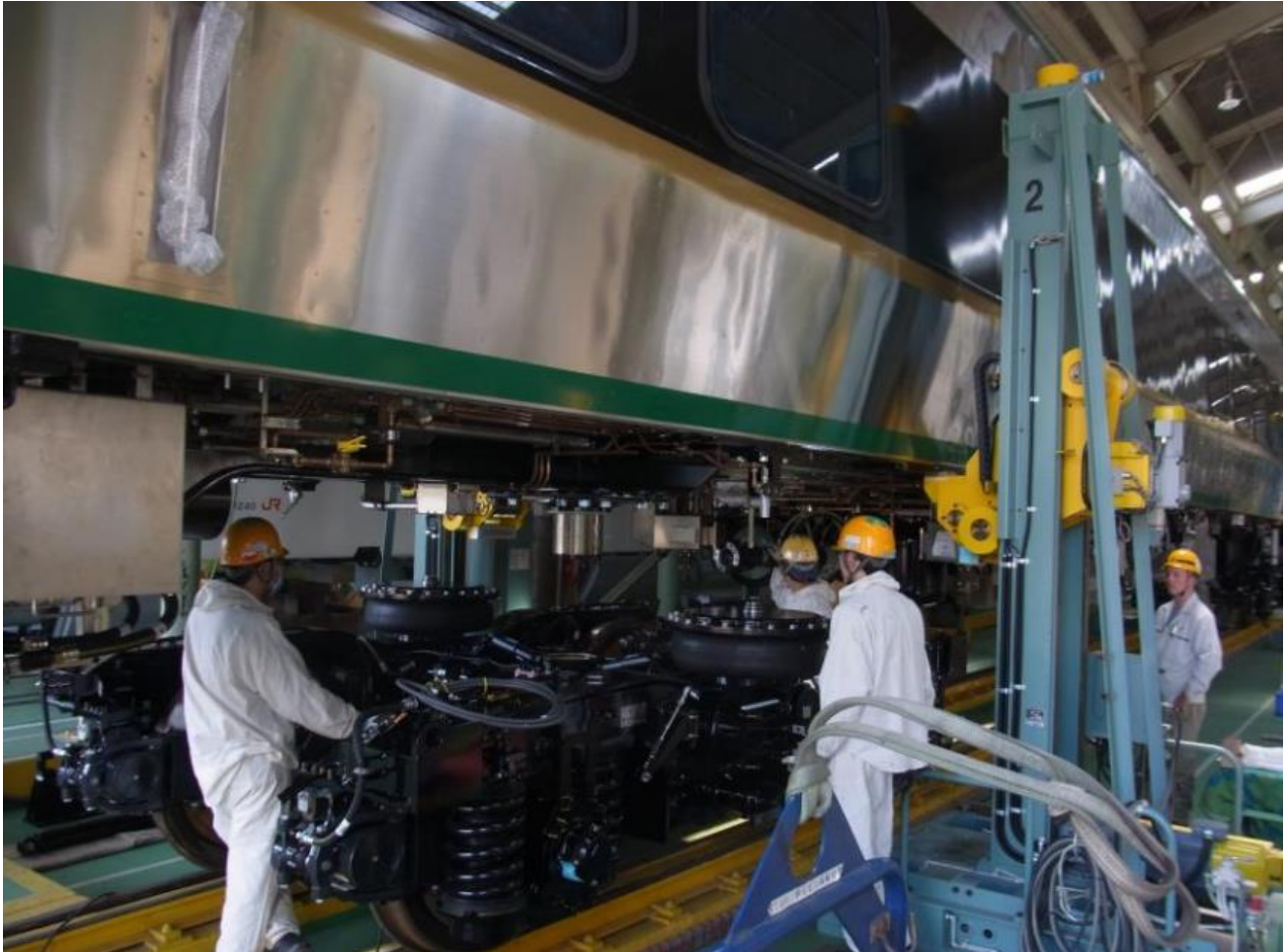
Trucks have been installed on the Four (4) Option Cars