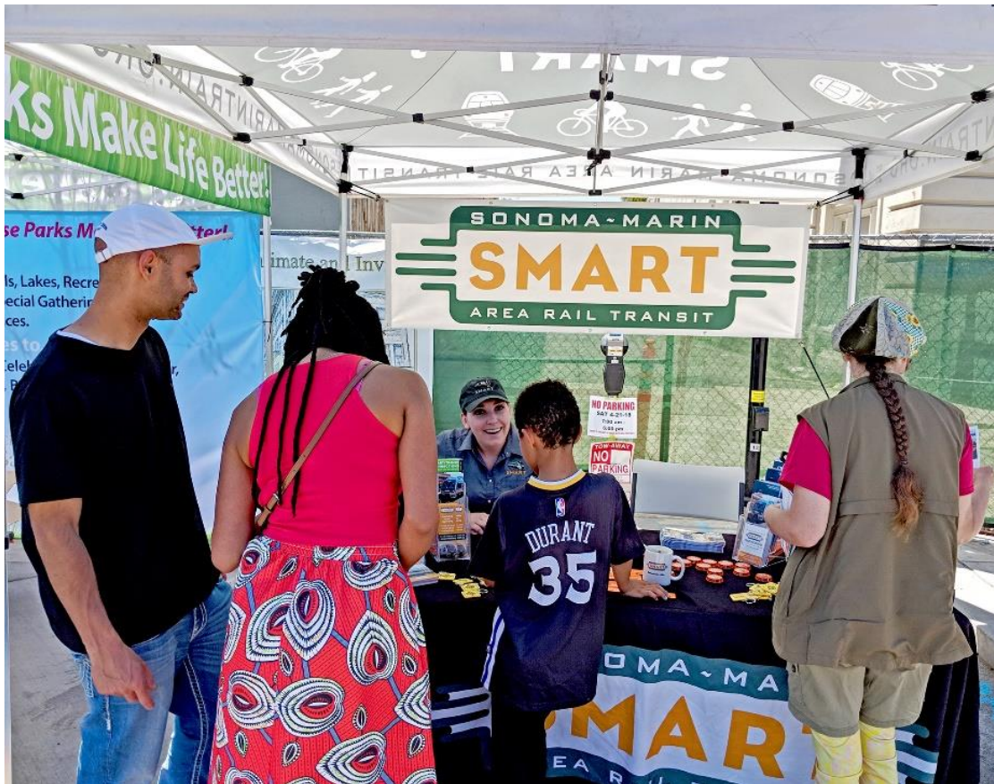
SMART's outreach team participated in Earth Day Santa Rosa this month, providing important safety information and raising public awareness of SMART's passenger service.

The SMART train has proven to be a popular destination for school and community group field trips, with interest increasing during recent months. SMART's community outreach team has taken this opportunity to incorporate a platform safety briefing program as part of our regular outreach efforts. The program presents groups with age appropriate material about railroad safety and prepares them to be knowledgeable transit riders.