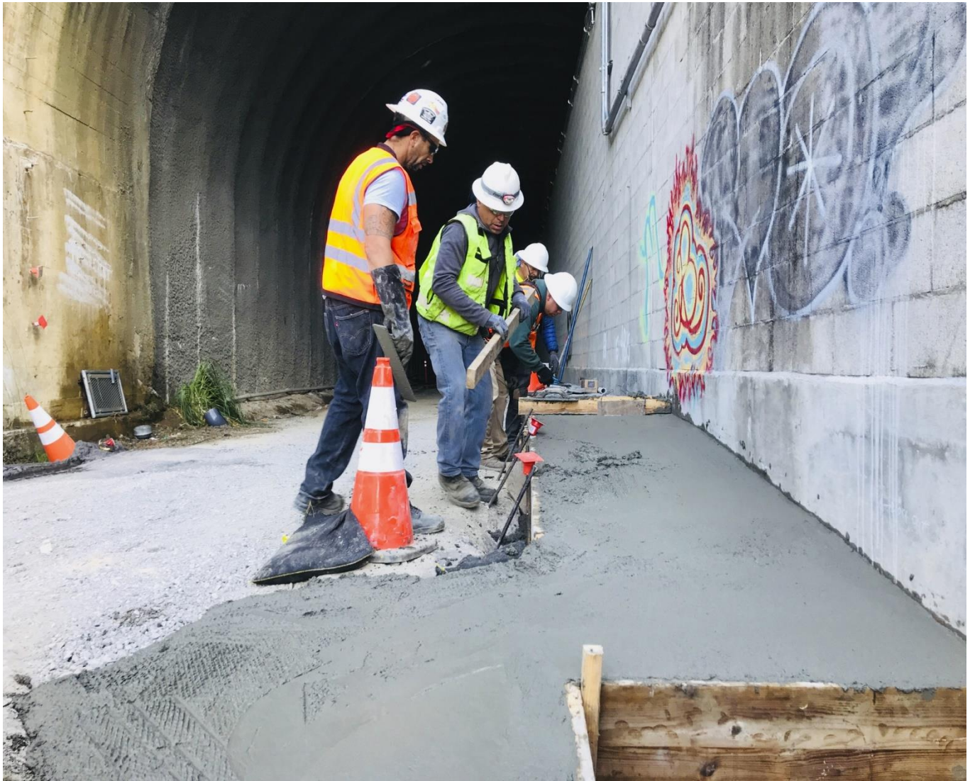
Construction of the emergency walkway at the Cal-Park Tunnel