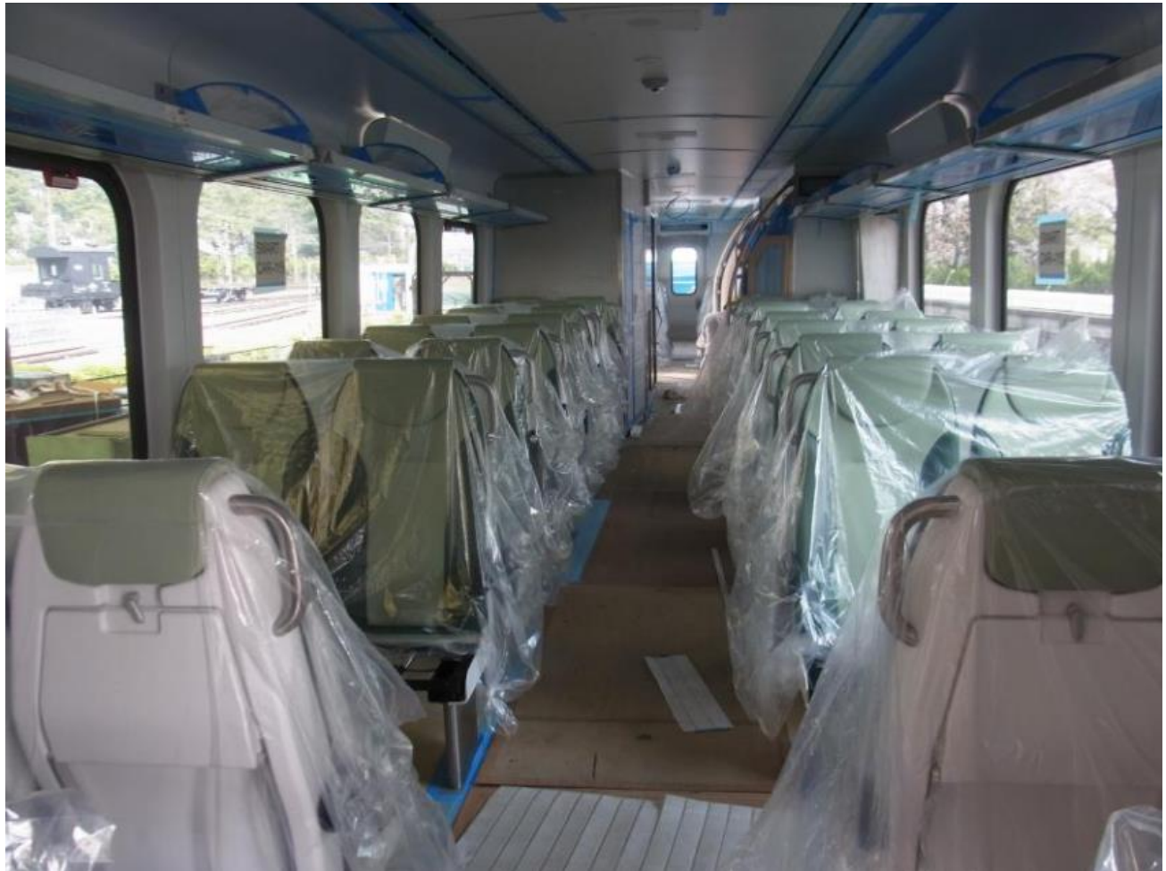
Seats are installed and left covered for protection