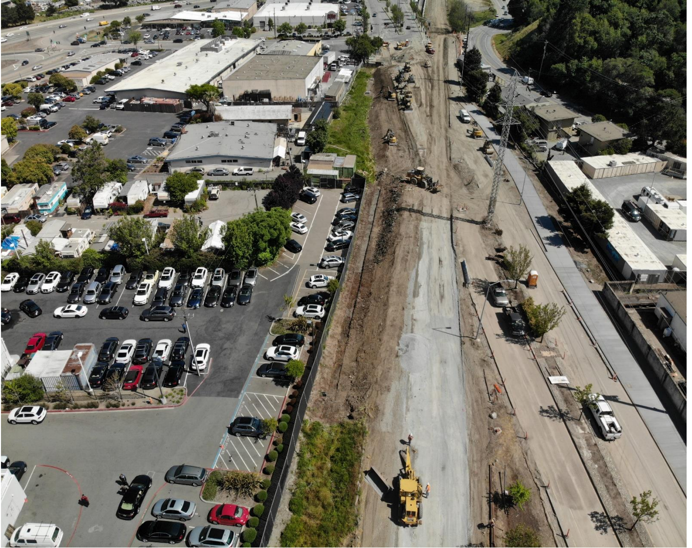
Aerial View of Andersen Drive Crossing Construction