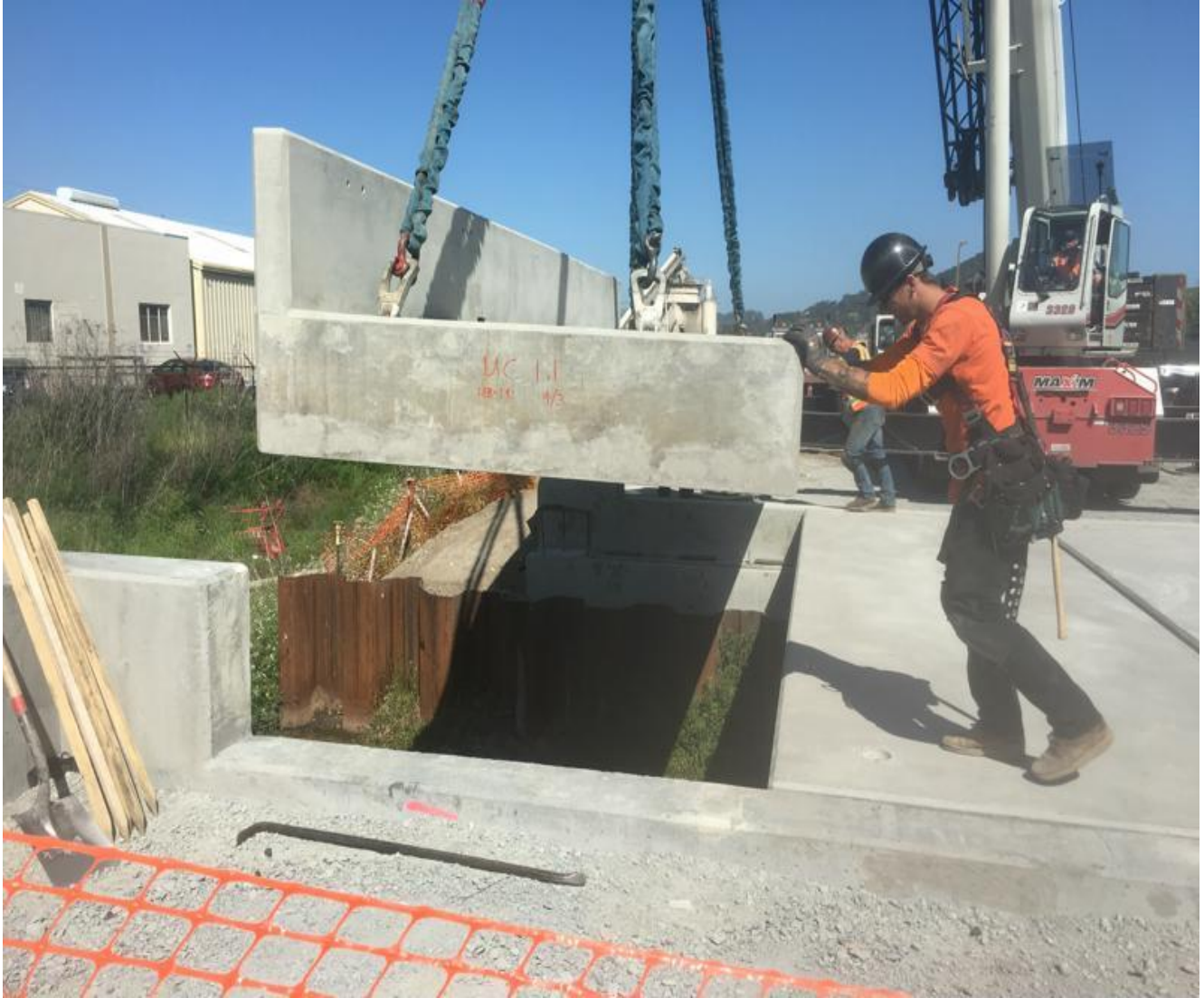
Installation of precast bridge components at the Unnamed Channel south of Rice Drive, San Rafael